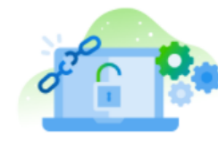
POST BREACH REMEDiation