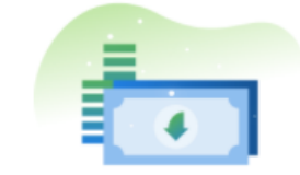
LOSS OF BUSINESS INCOME