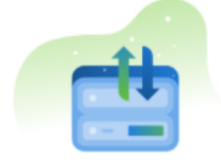
REPLACEMENT OR RESTORATION OF DATA