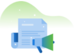
PUBLIC RELATIONS EXPENSES