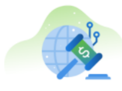
SECURITY BREACH LIABILITY