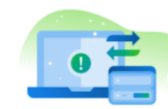
HARDWARE REPLACEMENT COSTS