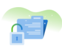
SECURITY BREACH EXPENSES

The portfolio of coverages in Cowbell Prime 100 is designed to address the diversity of cyber incidents and resulting damages that can impact businesses.