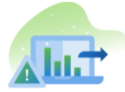
COMPUTER AND FUNDS TRANSFER FRAUD